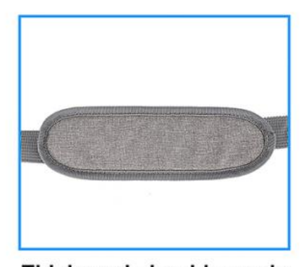
Thickened shoulder pads