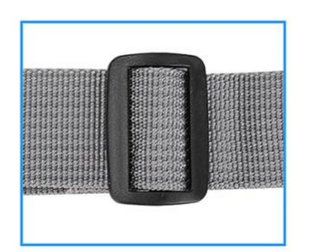
Adjustable shoulder strap