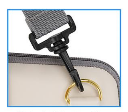
Detachable shoulder strap buckle