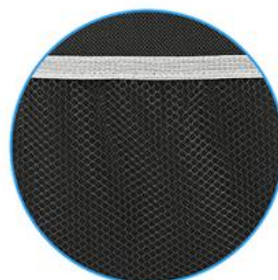
Three outer mesh pockets