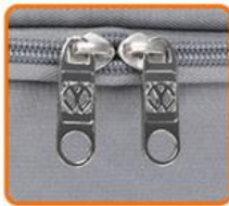
METAL DEBOSSED ZIPPER PULLER