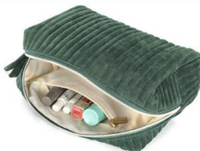
Inner zipper pocket