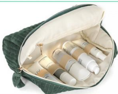
Elastic straps to hold bottles up right