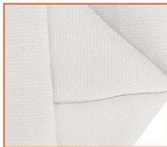
Neat stitching at the bottom