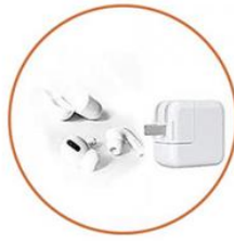
Headphones and charger