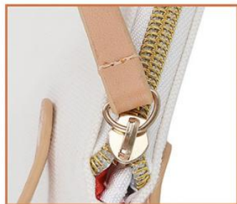
Wear-resistant metal zipper