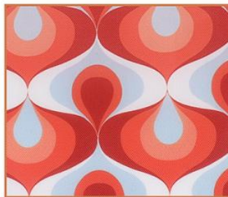
Exquisite internal pattern