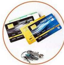
Keys and cards