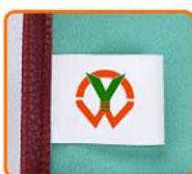
WASHING CARE LABEL