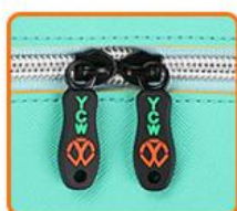
RUBBER ZIPPER PULLER