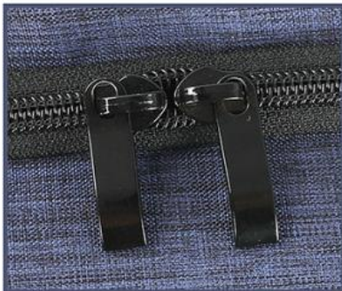
Metal double zipper