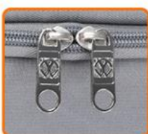
METAL DEBOSSD ZIPPER PULLER