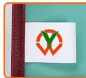
WASHING CARE LABEL