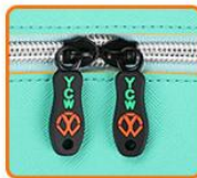
RUBBER ZIPPER PULLER