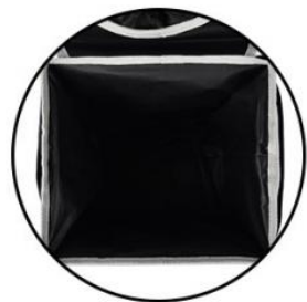
Large Capacity Space