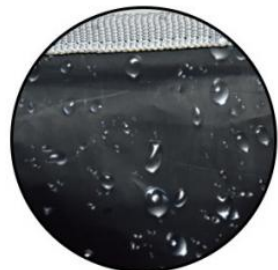
High-quality Waterproof Fabrics