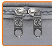
METAL DEBOSSED ZIPPER PULLER