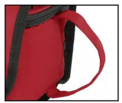
Comfortable carrying handle