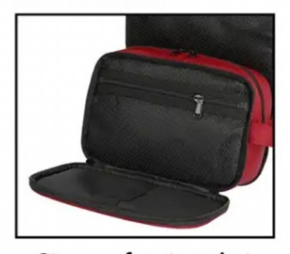
Storage front pocket