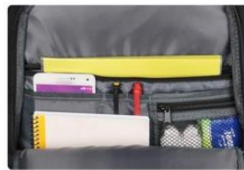
Middle Main Pocket