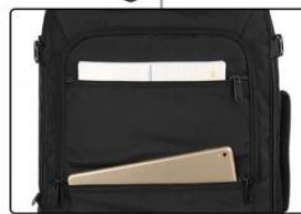
Front Zipper Pocket