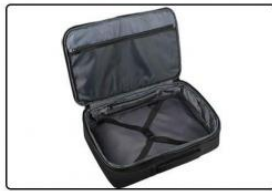
Back Main Luggage Pocket