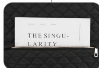
Front Zipper Pocket