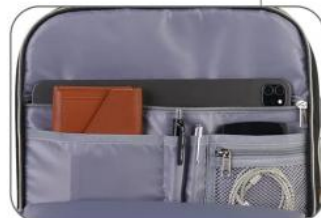
Middle Main Pocket