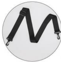
Reinforced Shoulder Straps