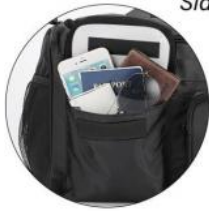
Front Velcro pocket