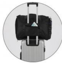
Luggage Trolley strap