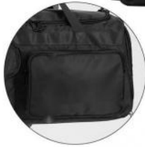
Front zip pocket