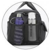
Side pocket design