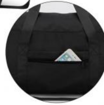
Back zip pocket